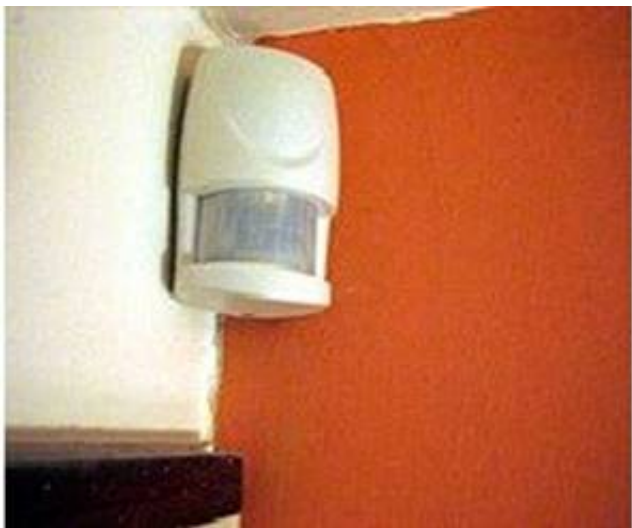
C:\Users\MCS\Desktop\1.jpg Passive Infrared Sensor

The passive infrared detector (PIR) is one of the most common detectors found in household and small business environments because it offers affordable and reliable functionality. The term passive means the detector is able to function without the need to generate and radiate its own energy (unlike ultrasonic and microwave volumetric intrusion detectors that are ??active?? in operation). PIRs are able to distinguish if an infrared emitting object is present by first learning the ambient temperature of the monitored space and then detecting a change in the temperature caused by the presence of an object. Using the principle of differentiation, which is a check of presence or nonpresence, PIRs verify if an intruder or object is actually there. Creating individual zones of detection where each zone comprises one or more layers can achieve differentiation. Between the zones there are areas of no sensitivity (dead zones) that are used by the sensor for comparison.