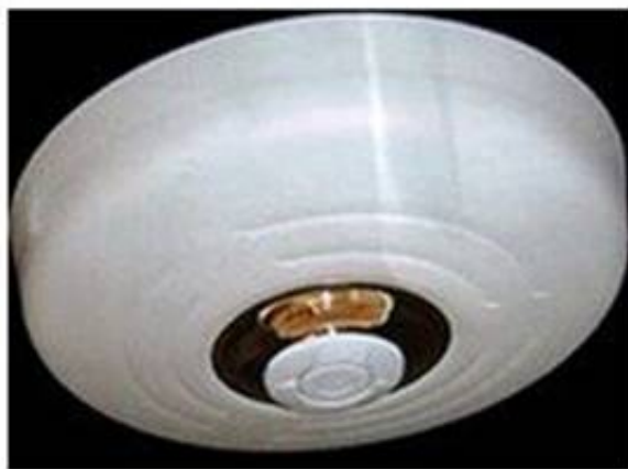
C:\Users\MCS\Desktop\1.jpg Heat Detection System

Smoke, heat, and carbon monoxide detectors